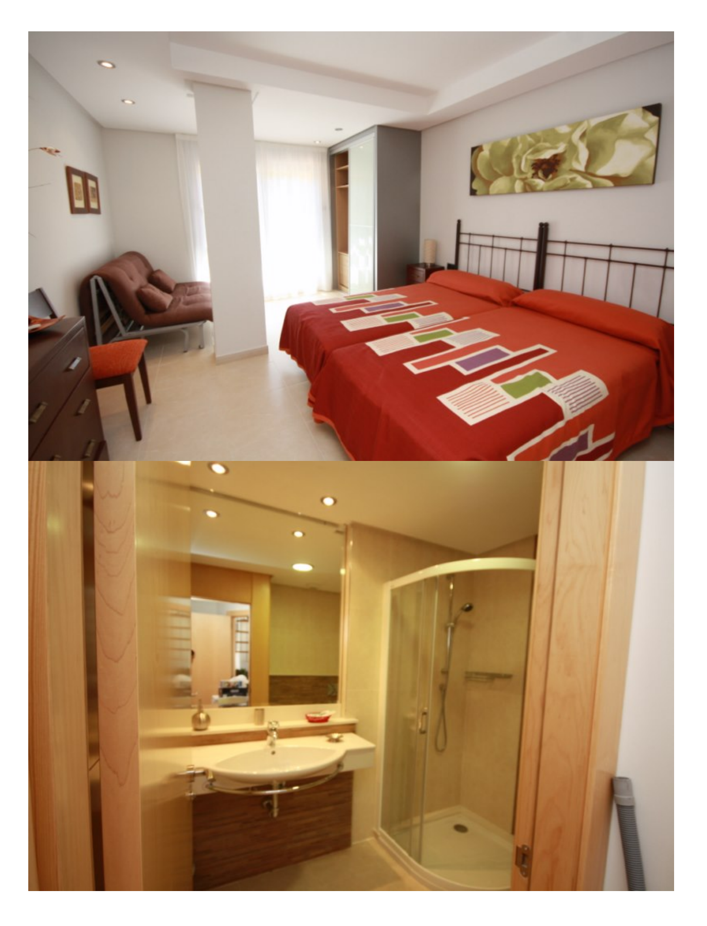
"OUR EXPERIENCE IS YOUR GUARANTEE"