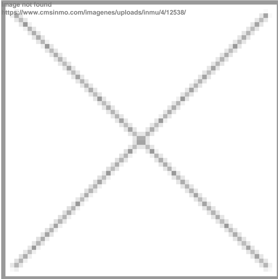
Image not found https://www.cmsinmo.com/imagenes/uploads/inmu/4/12538/